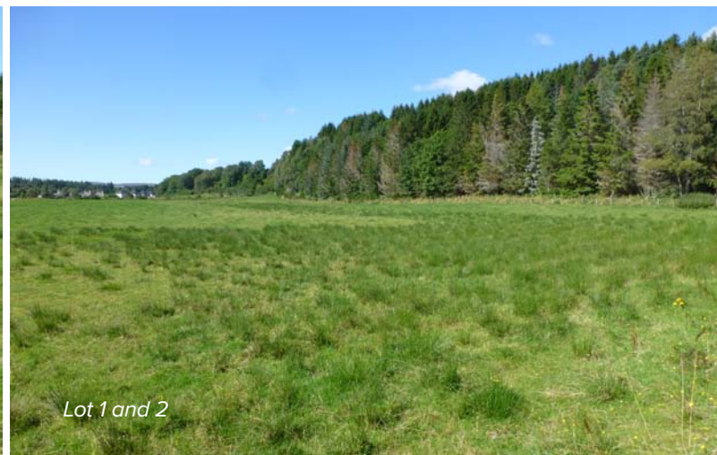
Lot 1 and 2