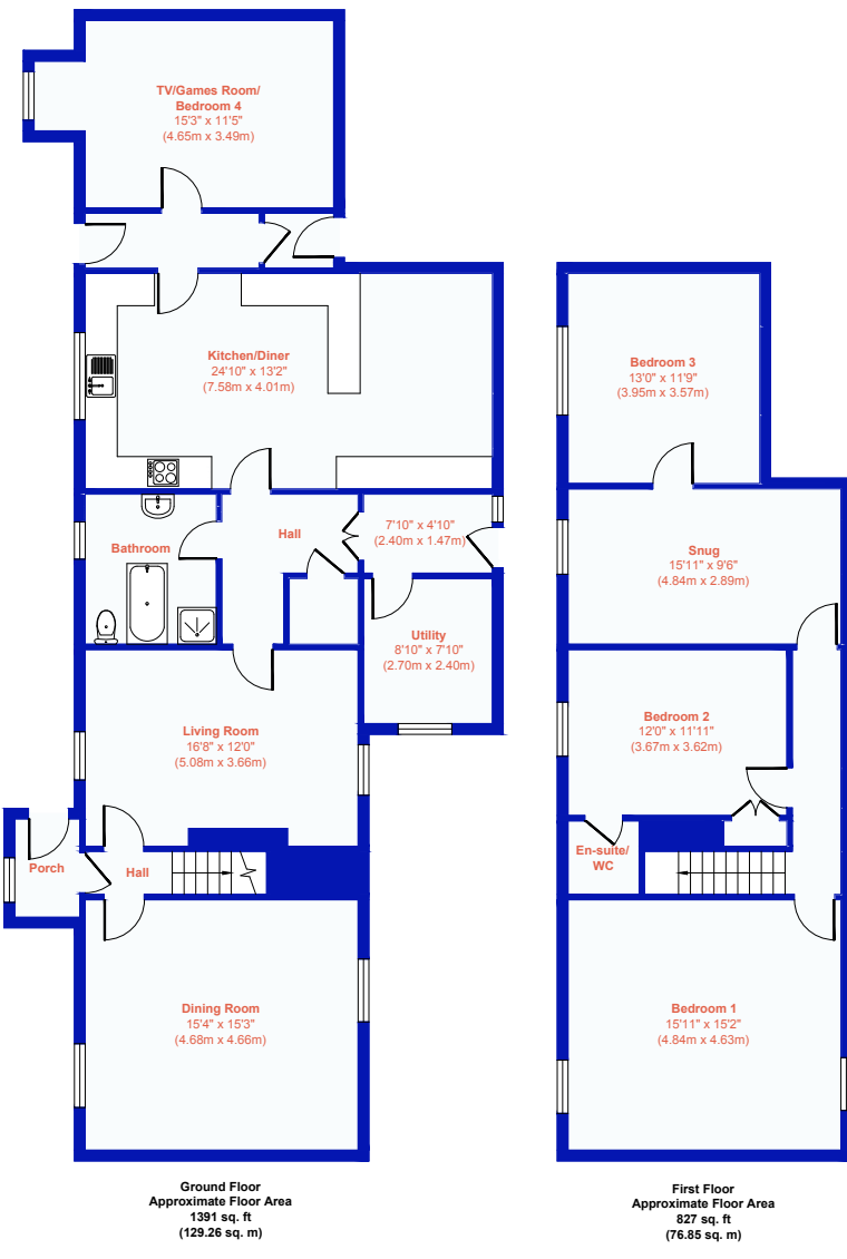
Approx. Gross Internal Floor Area 2218 sq. ft / 206.11 sq. m Illustration for guidance only, measurements are approximate, not to scale. Produced by Elements Procerty