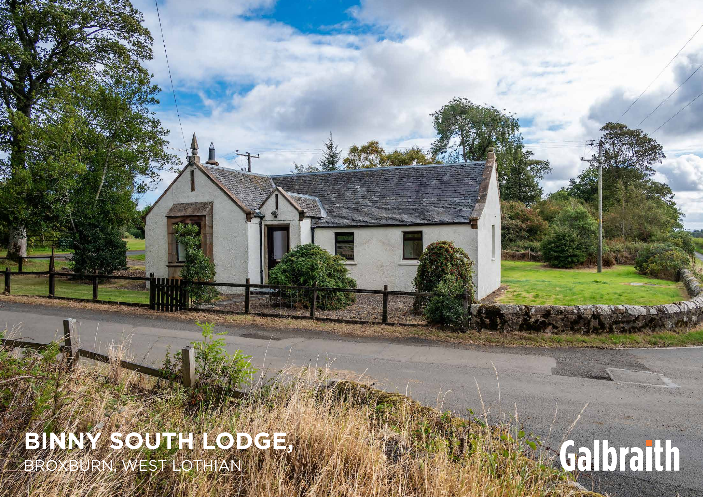
BINNY SOUTH LODGE, BROXBURN, WEST LOTHIAN