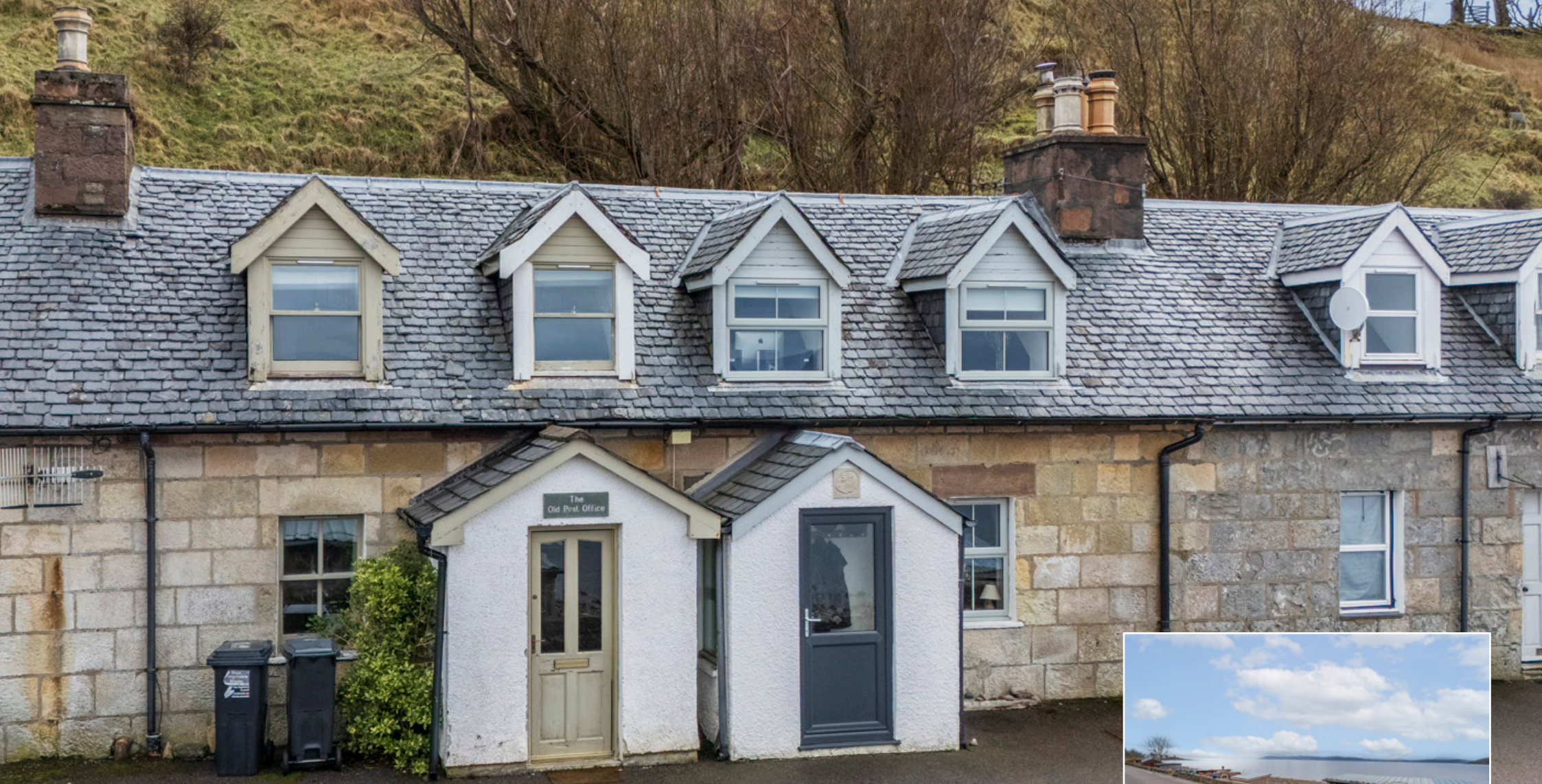
5 SHORE STREET APPLECROSS, WESTER ROSS