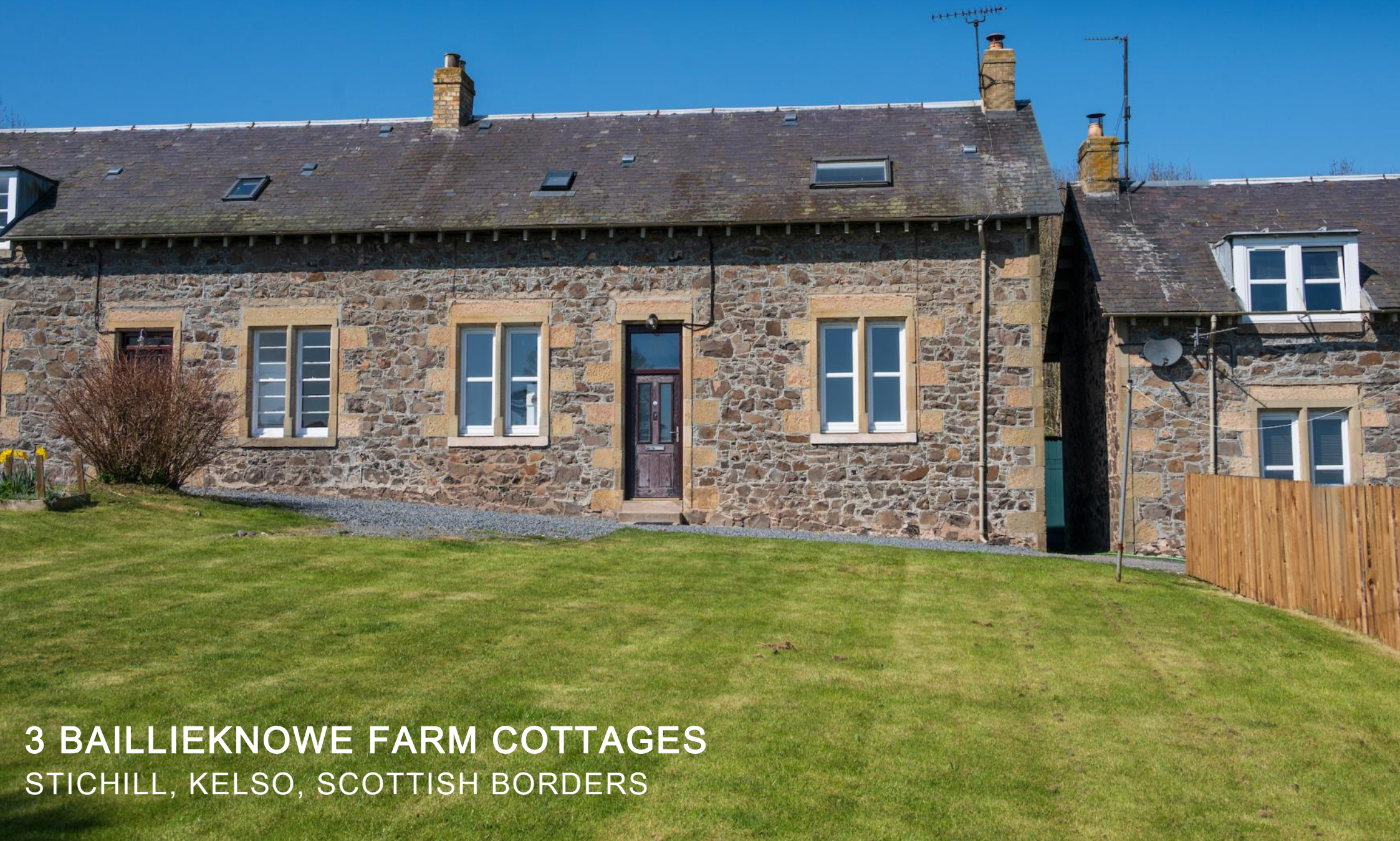
3 BAILLIEKNOWE FARM COTTAGES STICHILL, KELSO, SCOTTISH BORDERS