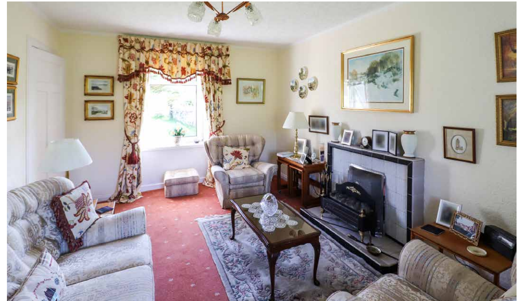
The double aspect sitting room with open fire.

Northton House is a traditional former croft house. The property was fully modernised about 25 years ago and since then has been very well maintained with full interior refurbishment and exterior painting less than ten years ago.