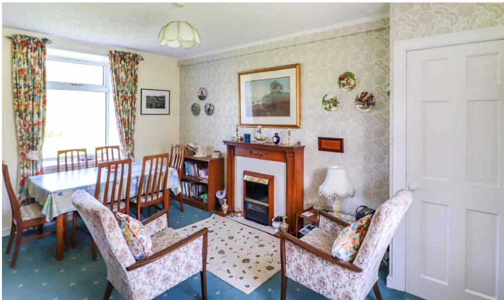
The double aspect dining room with door to kitchen.