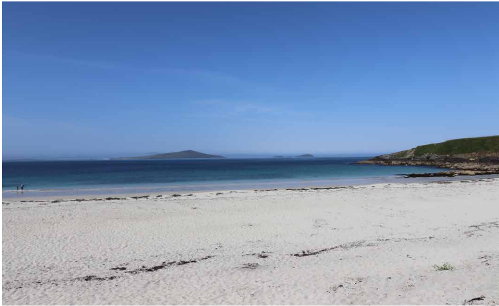
A beach within walking distance.