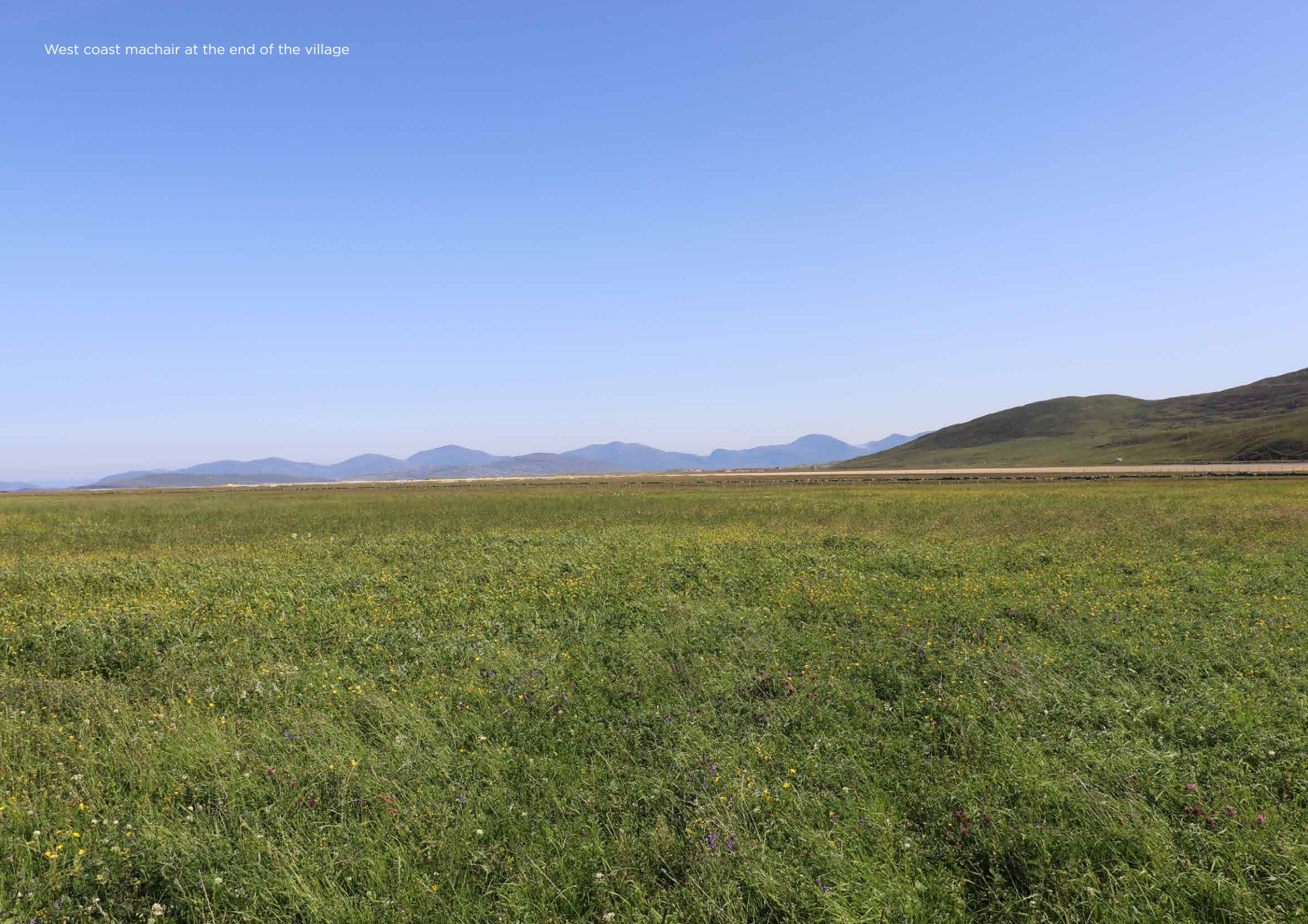
West coast machair at the end of the village