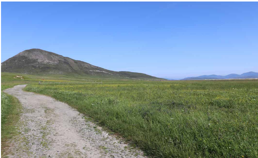
Machair close to the village.