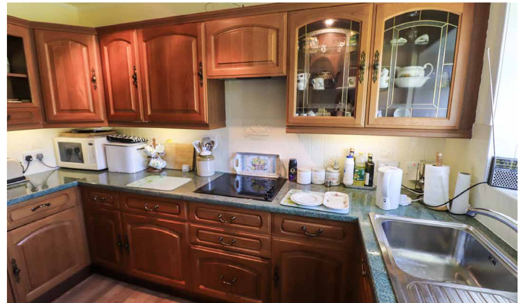
The fitted kitchen with integral appliances.