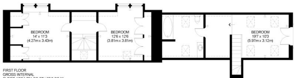
FIRST FLOOR GROSS INTERNAL FLOOR AREA 731 SQ FT / 67.9 SQ M