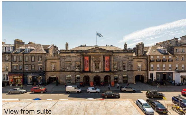
View from suite

The Agents for themselves and for the vendors or lessors of this property whose agents they are give notice that: