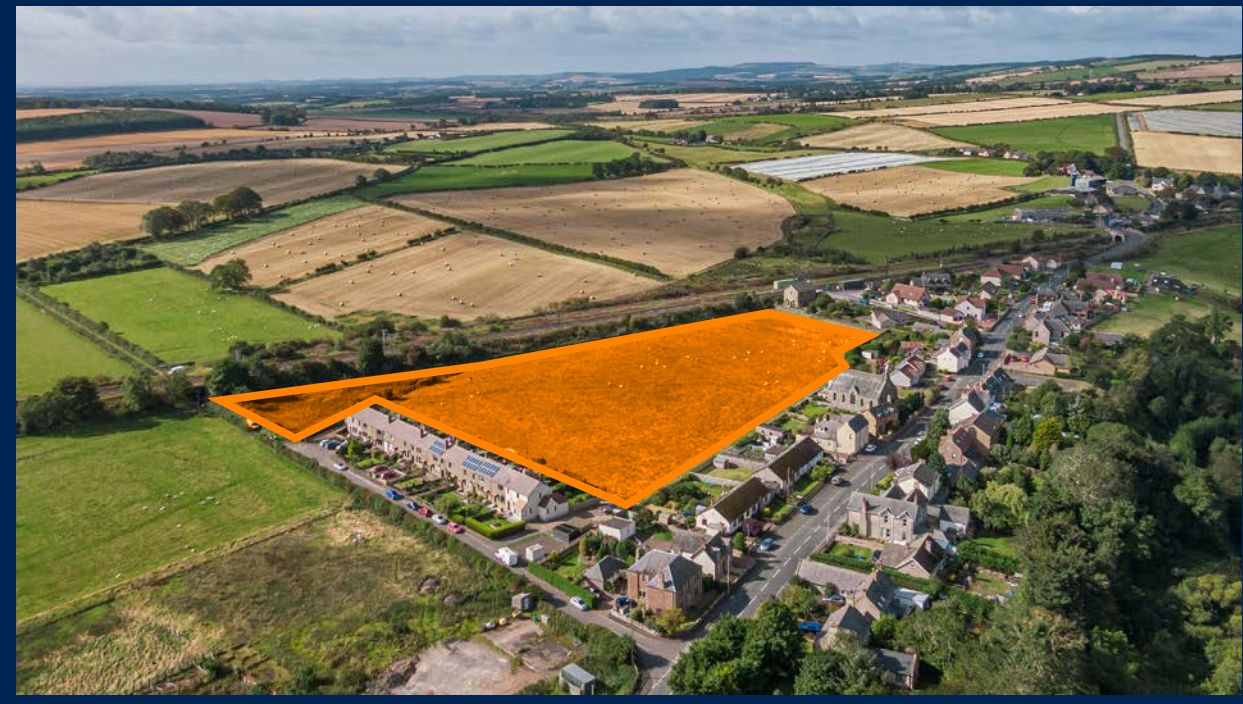
Note: Photographs taken August 2020

Offices across Scotland | Sales & Lettings | Farm & Estate Sales & Acquisitions | Commercial | Rural | Energy Forestry | Property & Land Management | Sporting | Agricultural Loans | Subsidy Trading & Advice